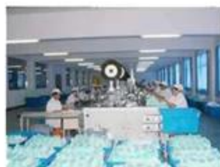
Dust free mask workshop