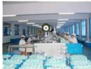
Dust free mask workshop