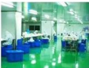
Dust free packing workshop