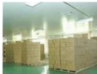
Finished products warehouse