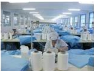
Dust free sewing workshop