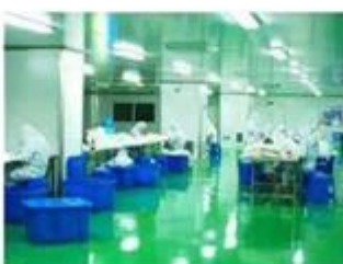
Dust free packing workshop