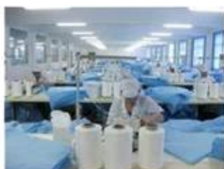
Dust free sewing workshop