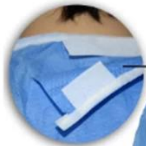
Velcro back neck