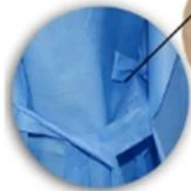
Tie on waist