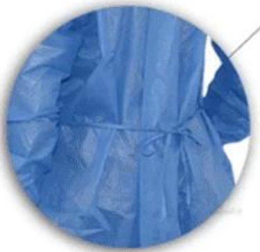
Tie on waist