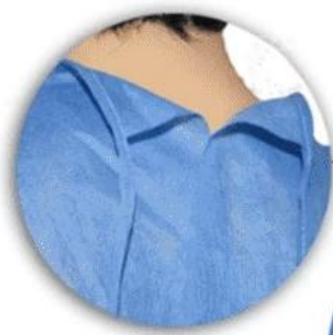
Tie on neck