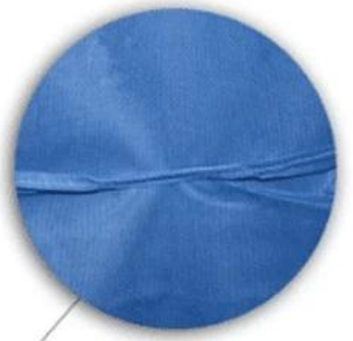
Tie on belly