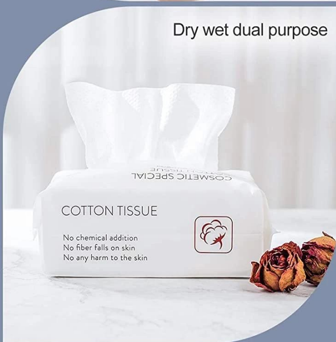
Dry wet dual purpose