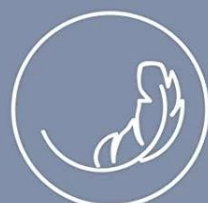
The power of touch