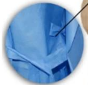
Tie on waist