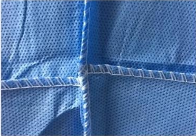
Ultrasonic sealing seams